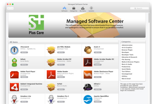
Example of the managed software center